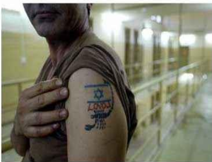
A guard at Abu Ghraib prison.

Apart from the clear reference to the 9/11 terrible events that the number 911 alludes to, this particular symbol of a scorpion has a strong curious significance, author « David Hagberg » published a novel entitled "Allah's Scorpion" which is the code name of a massive terrorist plot by al-Quaida in