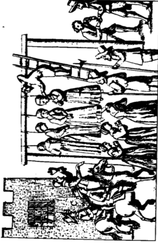
"Many poor women imprisoned, and hanged for Witches." Ralph Gardiner, England's Grievance Discovered (1655).

The root of ginger is used to bring on menstruation and enhance the effectiveness of other abortifacient herbs. The dosage is a decoction of the root, 1-2 Tbs. four to six times a day. Or tincture of the root 1-4 droppers, four to six times a day. 19